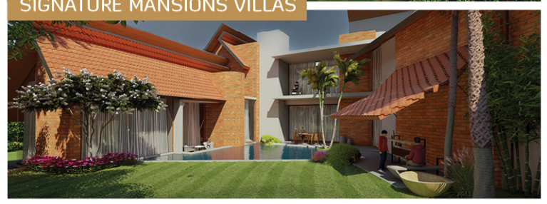
SIGNATURE MANSIONS VILLAS