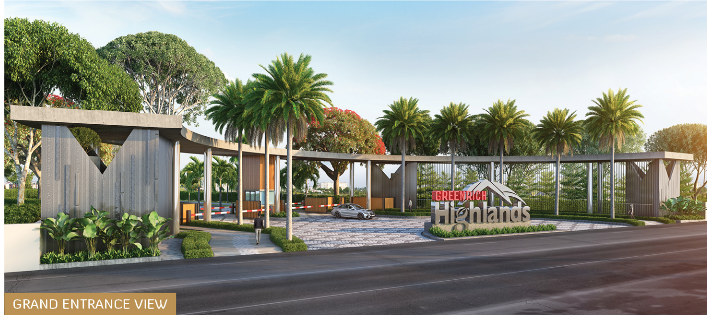
GRAND ENTRANCE VIEW